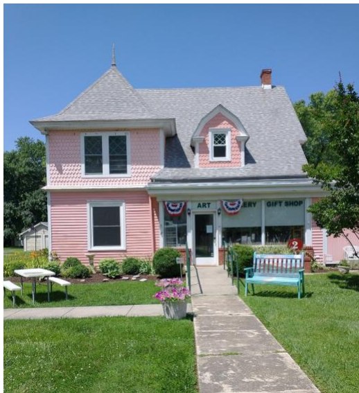
KIFA's home at 405 Main Street, in Stevensville, MD on Kent Island.

KIFA is currently open Thursdays through Sundays, and, per their website, it is best to call ahead to ensure that they are open.